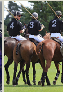
Royal County of Berkshire POLO CLUB